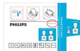
M5072A foil packaging