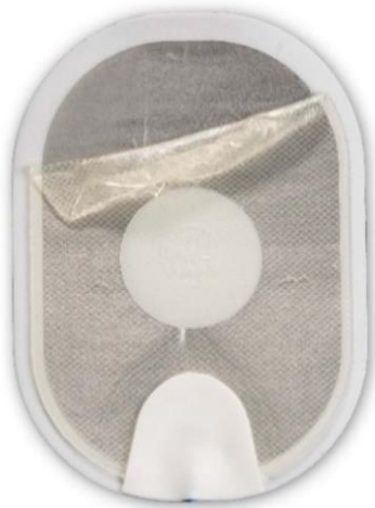
Figure 1: Separated gel that has folded onto itself when peeled.

It is also possible that the gel could separate almost completely from the foam/tin backing when peeled, (see Figure 3 .) Due to a small amount of gel surface contact area with the skin, electrical arcing could occur when a shock is delivered leading to burns to the patient's skin, or the AED could be unable to deliver any shock through the pads. A delay in therapy will result while the user installs a replacement pads cartridge (if available) or performs CPR while waiting for Emergency Medical Services Personnel to arrive. For comparison, Figure 4 shows a normal pad. No matter the state of the pad, follow the voice prompts because the AED will step you through the necessary actions.