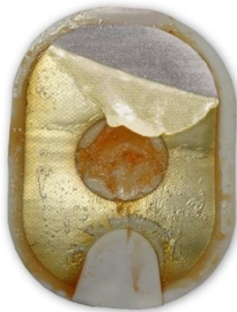
Figure 2: Separated, folded gel may also have a discolored and/or melted appearance.

Action: Apply pads to the patient. Do not hesitate.