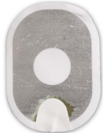
Figure 3: Gel almost completely separated from backing.

Action: Apply pads to the patient. Do not hesitate.